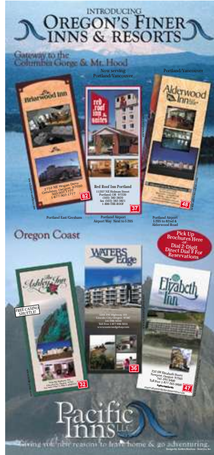
Original Size: 23" x 48"