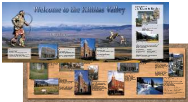
Original Size: 30" x 11"