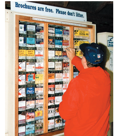
Our brochures in Travel InfoCentres are the most popular state service, according to travel surveys.