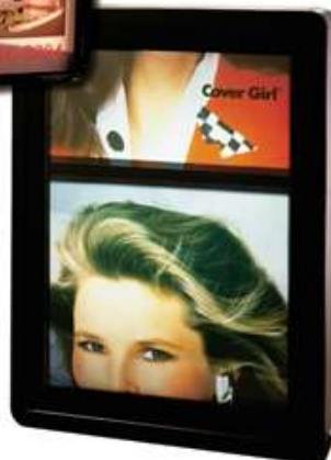
The backlit "Moving Pix" unit automatically rolls a series of displays on a timed sequence.