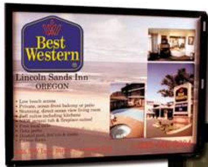
The wall frame above snaps open to allow easy access to the display.