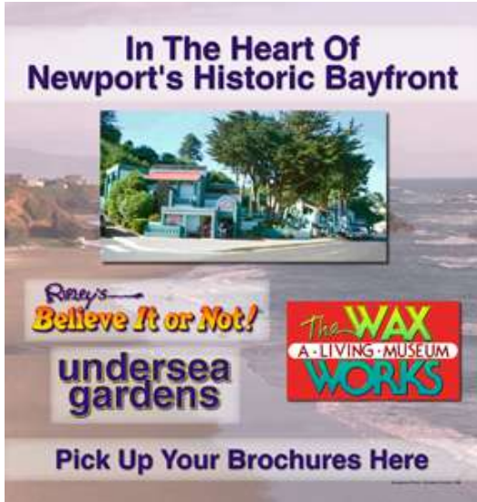
Original Size: 24" x 24"

STOREYCO utilizes state of the art computers and related technology.