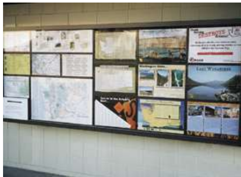
Lightboxes are available in aluminum, plastic and wood finishes in any size.