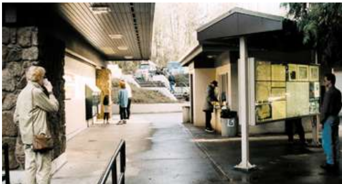
A typical Washington rest area with a brochure dispenser on the back left wall, free coffee service center and backlit display kiosk on the right.