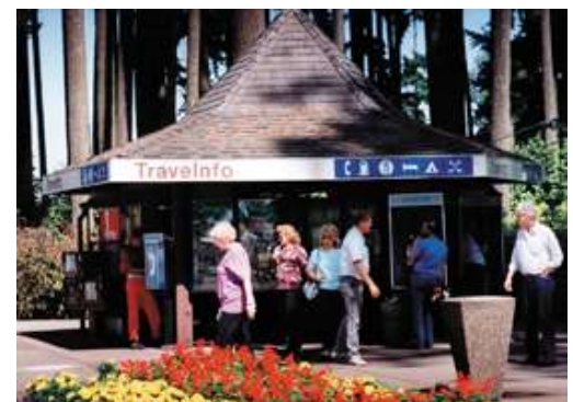
Backlit displays in the Oregon Travel InfoCentres are 60% advertising and 40% public information. (Maps, parks, etc.)

Call us for specific advertising space rates.