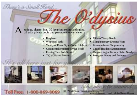
Original Size: 23" x 15"

Just look at the examples from our portfolio! Our designers are the best!