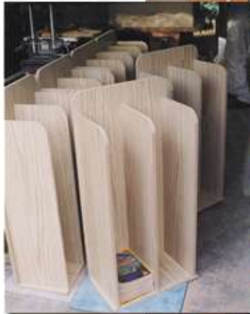
The above units are perfect for the distribution of magazines or pamphlets indoors.