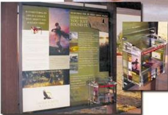
The single brochure dispenser to the left is constructed from 3/8" clear plexiglass and can be wall-mounted indoors or out.