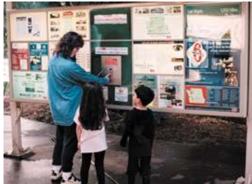
A family uses the free phone service to make reservations.