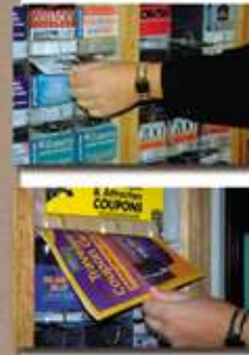
The above dispenser design can accommodate both brochures and pamphlets indoors or out.