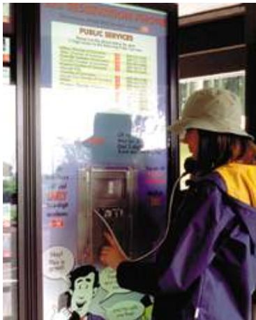
Most Travel InfoCentres offer a free telephone service that enables travelers to call you directly.