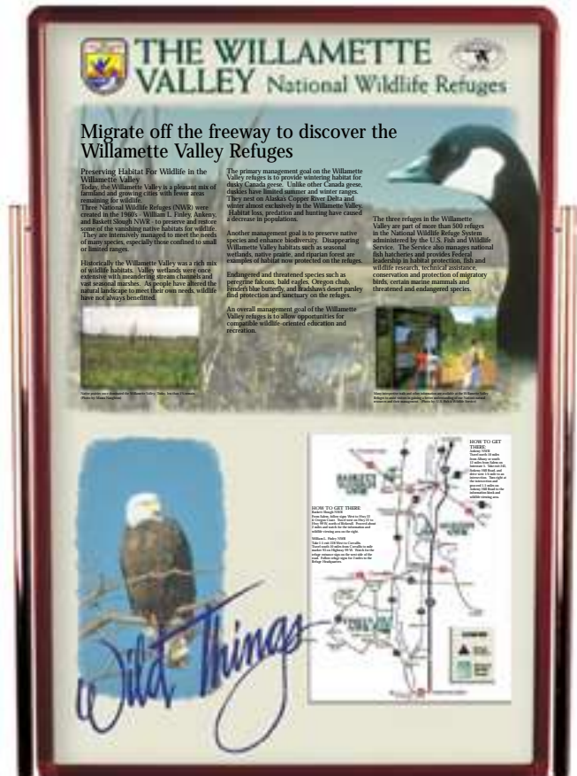
Double-sided frame with double-leg pedestal.